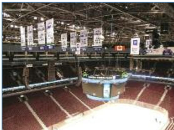
Top left: The Soundcraft Vi6 console in one of its mixing positions. A portable, triple-wide rack was built for it and its ancillary racks to use in any of three locations. Left: Upgrades to the center-hung scoreboard include the addition of six L-Acoustics' ARCS loudspeakers to improve on-ice coverage.