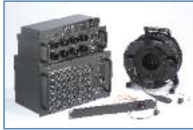
Above: Optocore gear. Right: Optocore fitted into the console rack at GM Place. On the following page: The Optocore system device layout.

“When we started talking about the distances we had to go, we were getting into milliseconds of latency. Then I went to InfoComm in June and saw Optocore, and the light went on for me, because not only did it do every-